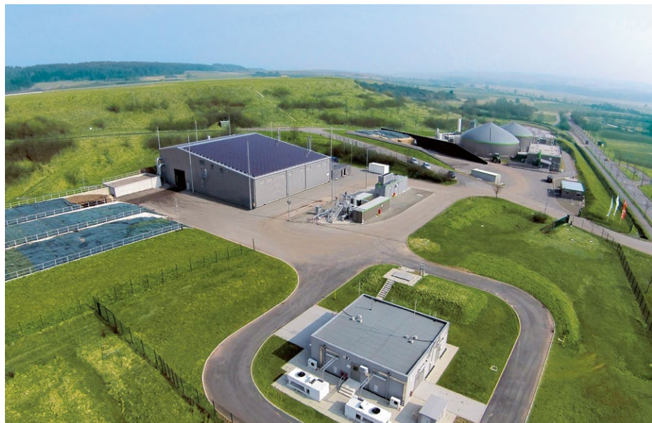
Integration of biological methanation at a biogas plant in Allendorf (Eder).

Whether your project is on a large or small scale, renewable methane from the sustainable BiON® process allows you to generate ecological added value to keep your company attractive and continue operating successfully with a clean conscience.